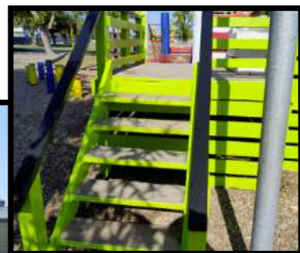
Snaps from our 'Meet & Greet' afternoon.