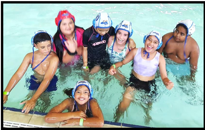
Waka Wairau Flippaball team