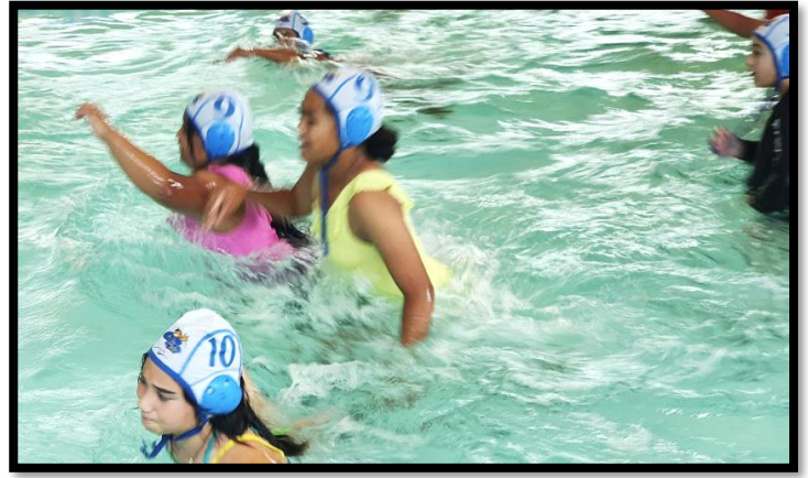
Wairau Warriors in action at Flippaball

Reminder - to please pay your Sports Fees at the office. Thank you to those who have already paid their fees.