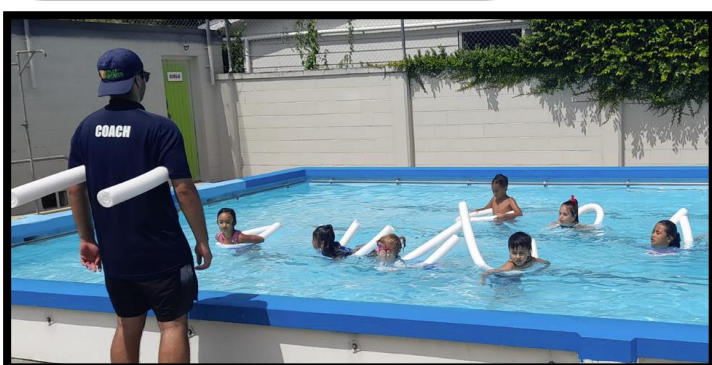
Room 14's first Swimsafe lesson with Coach D from Swimsafe NZ