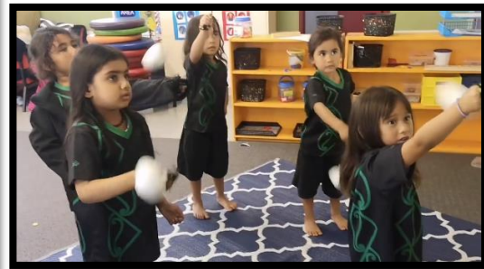
Room 12 practising their poi

Room 1 read a book written by Gavin Bishop (a NZ author) called Kiwi Moon . This led them to learn about the phases of the moon. They got to make the different phases out of Oreos. The best part was eating them at the end.