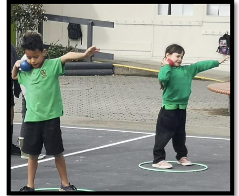
Room 8 have started Athletics. We began by learning how to throw a shotput